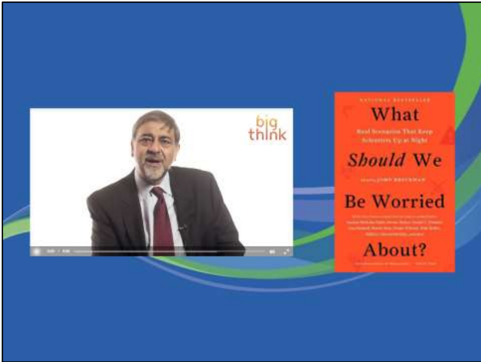
Introduction with video