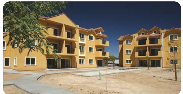
Arbor Grove, a new mixed-use development at 10th Street West and Jackman Avenue, is nearing completion. The project features affordable senior housing, retail shopping and many amenities on the 5.3-acre site. For more information on housing opportunities, visit www.AVSeniors.com or call 661-723-9015.

For more information, visit the City's Website or contact the City's Planning Department at 661-723-6248.