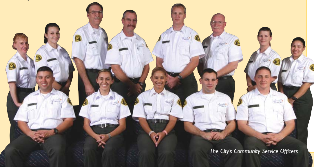
The City’s Community Service Officers

CSOs are often instrumental in solving crimes and following up. Two officers were recently recognized for their outstanding duty. One CSO’s effort to thoroughly investigate a burglary led to the arrest of five suspects. In another case, the CSO who took an initial report on a stolen computer, followed through and saw that the computer was returned, much to the relief of its owner.