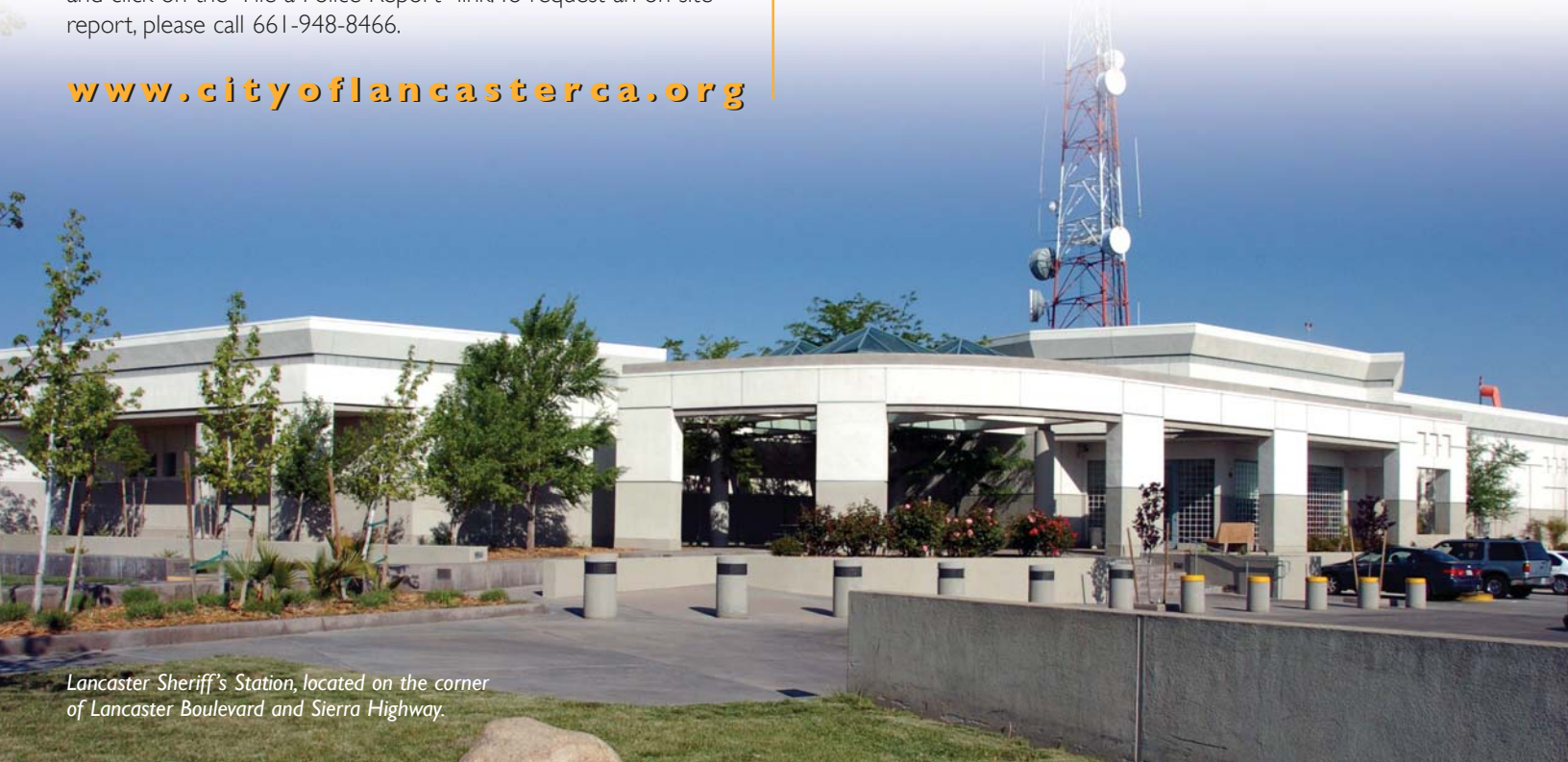
Lancaster Sheriff's Station, located on the corner of Lancaster Boulevard and Sierra Highway.

To date, the cameras have captured 3,000 violations while two recent DUI checkpoints screened over 1,200 drivers resulting in nearly 40 impounds and 40 citations. There have been over 300 DUI arrests in the first six months of 2006. Six other Traffic Task Force operations held in cooperation with the CHP, Union Pacific Railroad Police and the Palmdale Sheriff's Station have issued hundreds of citations to those who fail to obey traffic safety laws. All these efforts are aimed at reducing property damage, injuries and fatalities due to careless driving. Please obey traffic laws, drive safely...and buckle up!