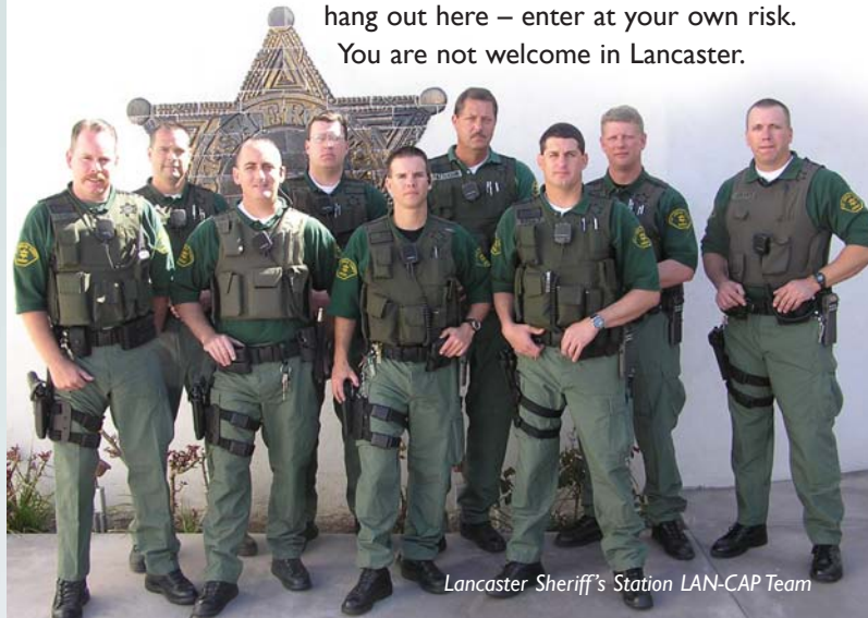
Lancaster Sheriff's Station LAN-CAP Team

The City is sending a clear message to criminals who choose to hang out here – enter at your own risk. You are not welcome in Lancaster.