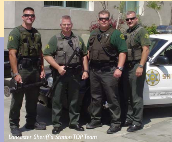
Lancaster Sheriff's Station TOP Team

The Target Oriented Police Team (TOP) that has proven to be so successful in addressing key issues is doubling its presence in 2007 to eight deputies plus a sergeant.