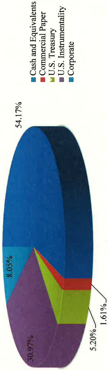
Portfolio / Segment Diversification