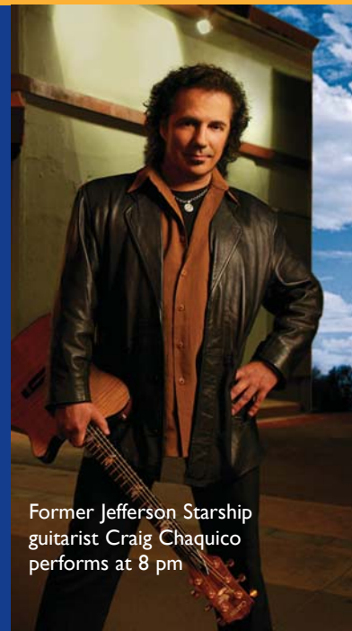
Former Jefferson Starship guitarist Craig Chaquico performs at 8 pm

"Celebrate Downtown" presented by the City of Lancaster, Lancaster Old Town Site and the Antelope Valley Chambers of Commerce.