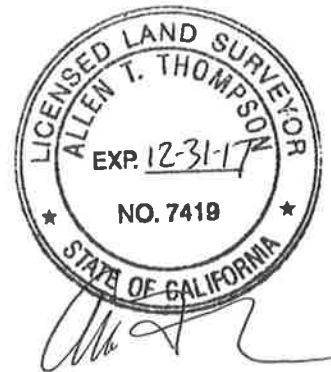
EXHIBIT "B" IS ATTACHED HERETO AND BY REFERENCE MADE A PART HEREOF.