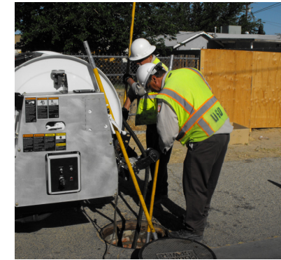
Utility workers operating a jetting machine to clean grease and clear flushable wipes from sewer pipes