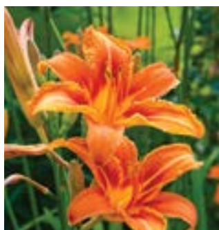
Flowers in Bloom