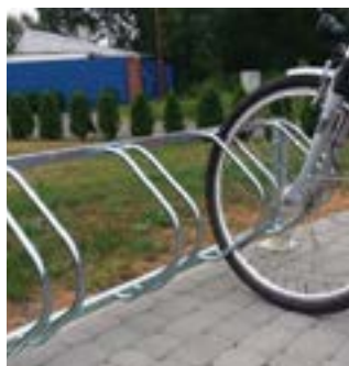
Bike or Scooter Parking