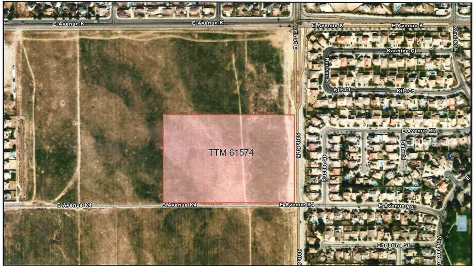
Figure 1, Project Location Map