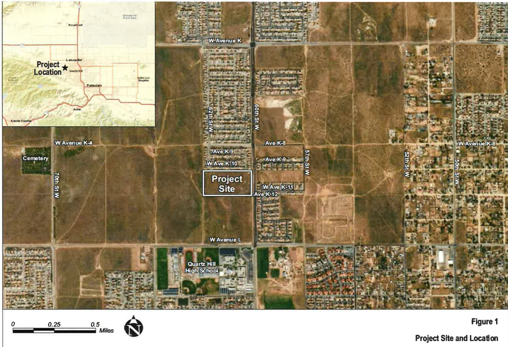
Figure 1 Project Site and Location