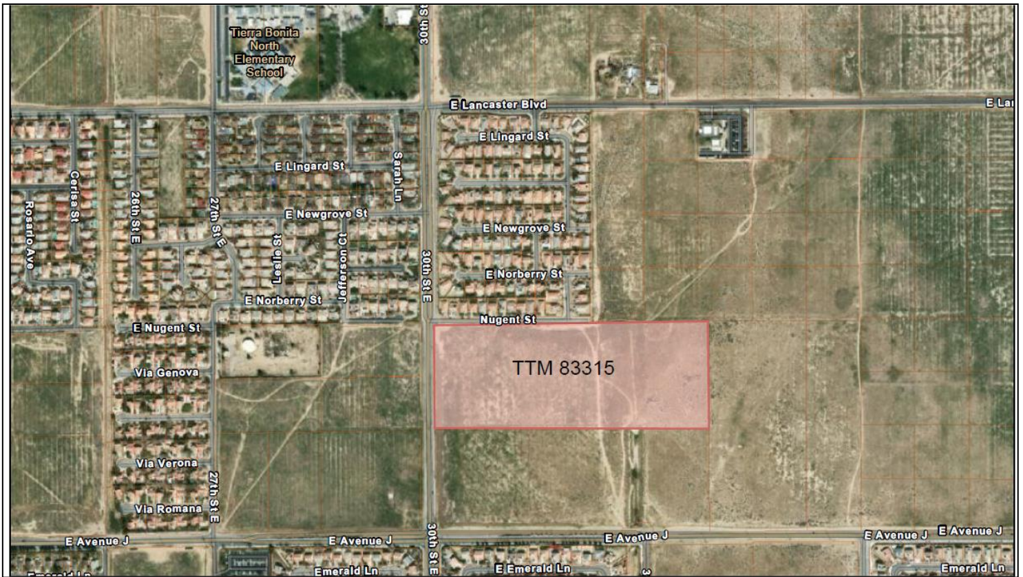
Figure 1, Project Location Map