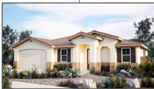
Fees to build in Outer Zone = $13,612.01 (No fee reduction)