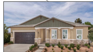
Fees to build in City Core = $13,612.01 (45% Lot Coverage = 40% Impact Fee Reduction)