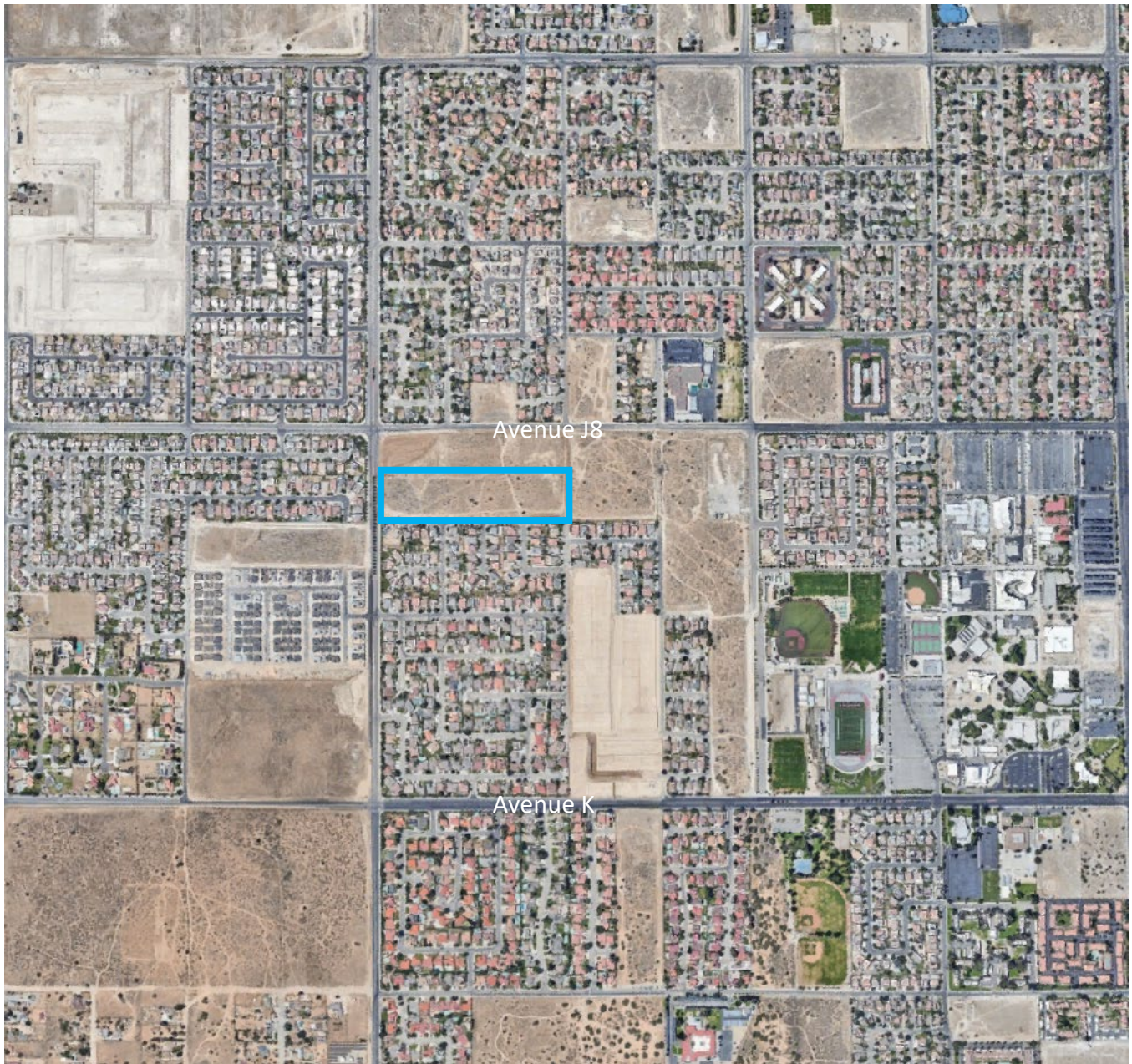
Figure 1, Project Location Map