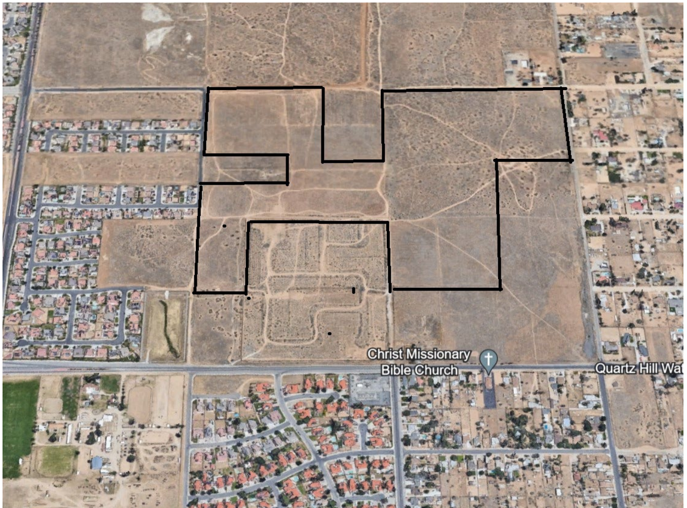
Figure 1, Project Location Map