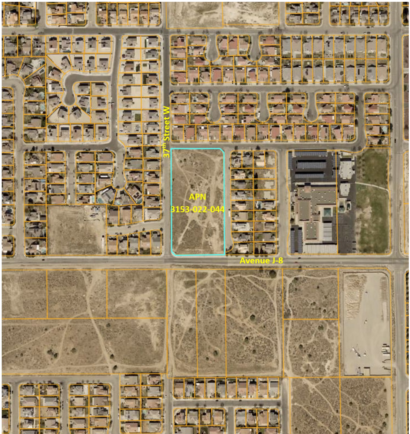
Figure 1, Project Location Map